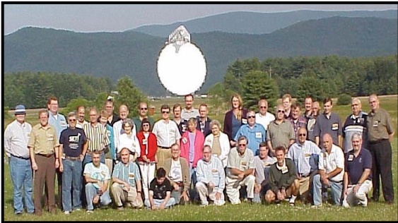
SARA 20 th Anniversary Conference at NRAO (2001) (A few of our members from 17 countries)

Thank you for your interest in the Society of Amateur Radio Astronomers .